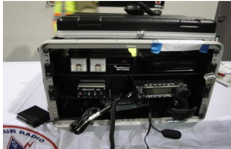
Figure 3Figure 2 1 of 2 Go Kits - ARES Hardin Co