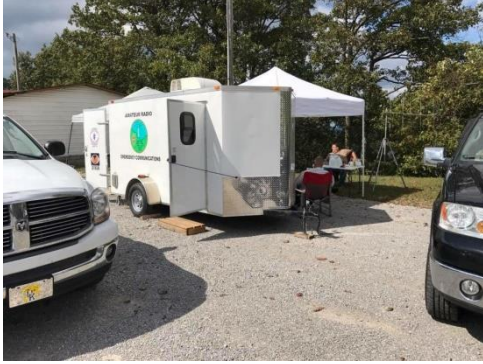
Figure 5 Letcher Co Hamfest

The club holds a Hamfest each year in April that draws in Hams from Kentucky, Virginia, and Tennessee. This year's Hamfest will be held Saturday April 14th from 8am to Noon in the Mountain Shrine Club at 95 Maryland Drive Whitesburg, KY 41858. Admission is $5 and tables at $10 for Hams wishing to sell items. Tailgating is free with one paid . This year the clubs goal is to grow interest in the 220 MHz band. That is why we are giving away a new TYT-9000D 220 transceiver and antenna. The club uses the East Kentucky 220 MHz linked repeater system along with the East Kentucky 2M linked system to hold