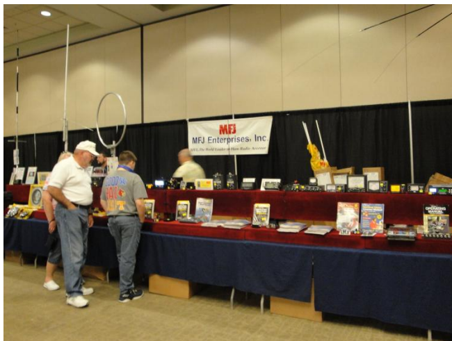
Figure 2 VETT CITY HAMFEST 2018