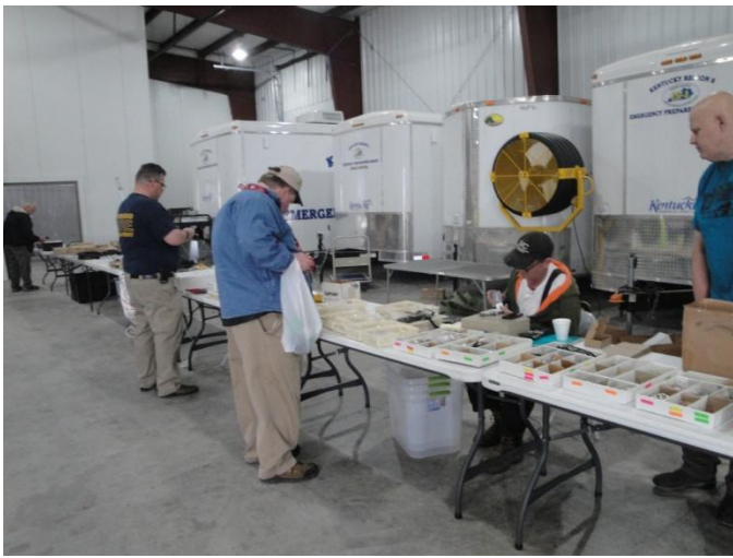
Figure 5 Morehead Hamfest 2018