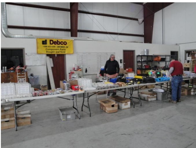
Figure 4 Morehead Hamfest 2018