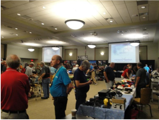
Figure 7 Vett City Hamfest 2018