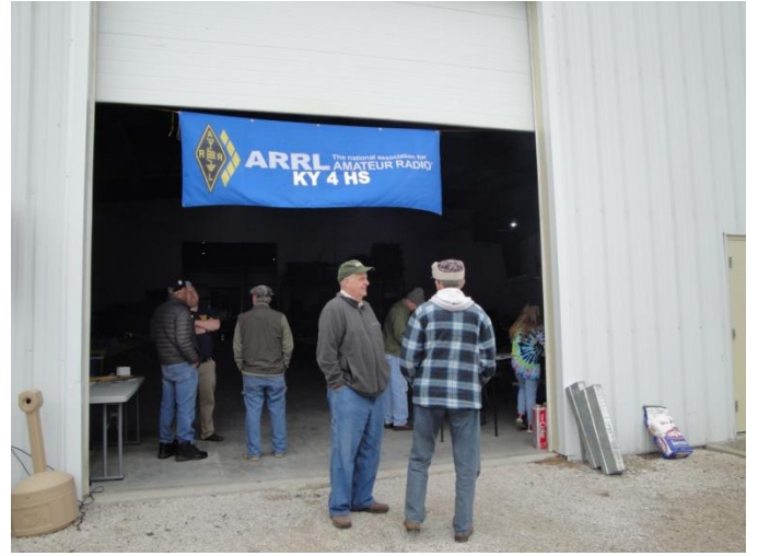
Figure 3 Morehead Hamfest 2018