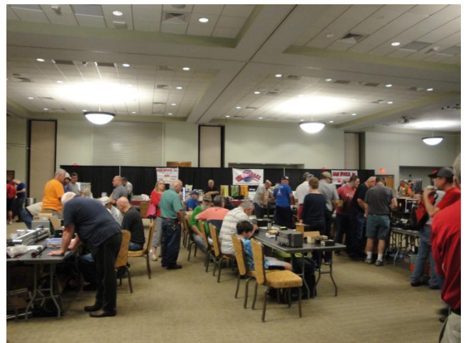
Figure 1 VETT CITY 2018