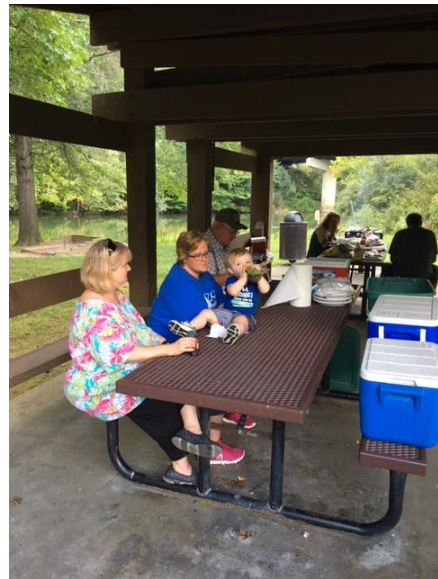
Figure 3 Cookout