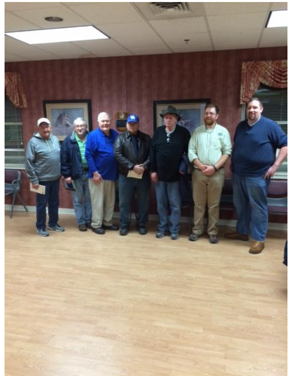
Figure 2 Hazard Weather Spotting Class