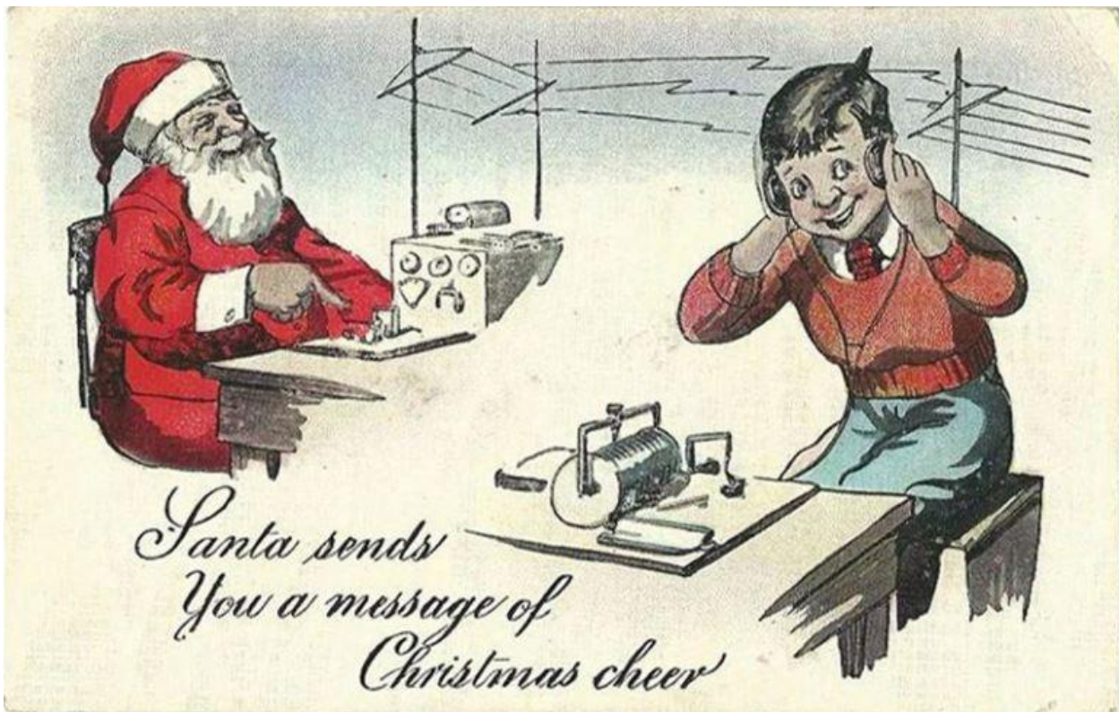
Figure 1 From Skip: N2EIZ : May your Christmas wish come true / Remember the reason for the season!