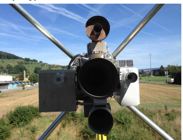
Looking at the business end of the "feed turret" shows how HB9Q puts the big 10-meter diameter dish to work. In the center is the 1296 MHz feed with the 2.3 GHz feed underneath. On top is the 3.4 GHz feed, at the right is the 5.76 GHz feed, and 10 GHz is on the left.

While change always results in various degrees of controversy, what was the outcome? Three weekends for EME action was just not enough! With so many stations adding and improving their microwave capabilities, there was a request to add more weekends for the bands at 2304 MHz (13 cm) and above in order to have more time to operate the five (or more) microwave bands popular for EME activity.