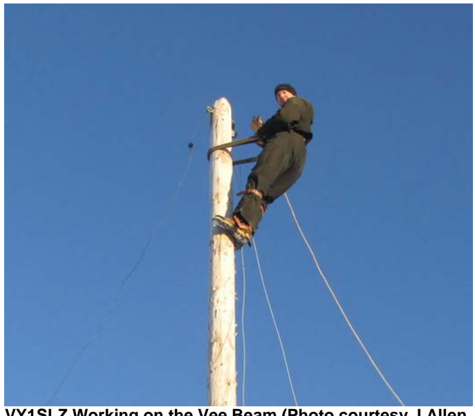
VY1SLZ Working on the Vee Beam

Low bands are amazingly quiet from the Yukon — Beverages optional. Because of the quiet, often you hear many people you cannot work.