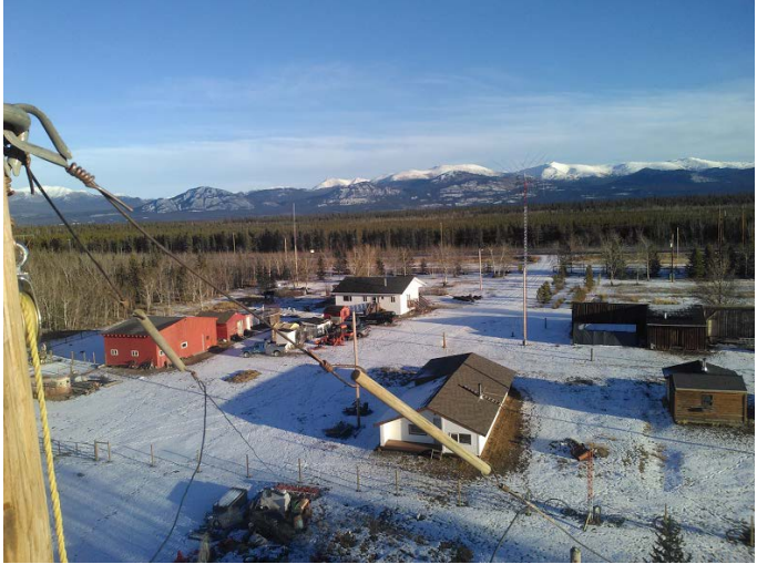
View from apex of VY1AAA Vee Beam

and, currently, the ends are only at 40 feet. However, the elements are 600 feet long.