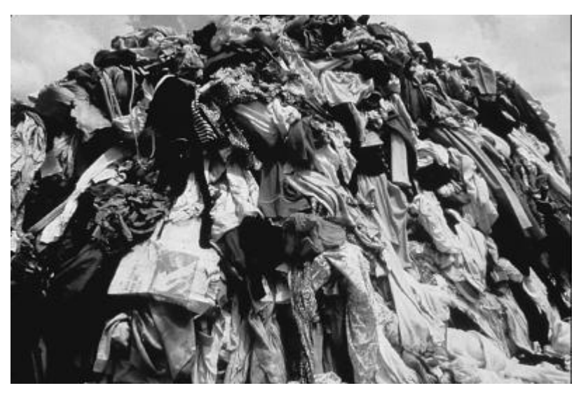
This is an example of the enormous waste of donated clothing after Hurricane Andrew. Poor donations management planning can lead to horrendous logistics and public relations problems. Ultimately, it results in poor service to both the donors and the community in need.

Voluntary agencies set up shelters for evacuees. It quickly became evident that the sheltering requirements for tens of thousands of residents was beyond the capacity of the voluntary agencies. For the first time, voluntary agencies and the military worked together to provide temporary "life support centers" to accommodate large numbers of people. The problem of unsolicited goods also required significant military support in the receiving, storing, transporting and distributing of these goods. This lack of donations management planning on the part of