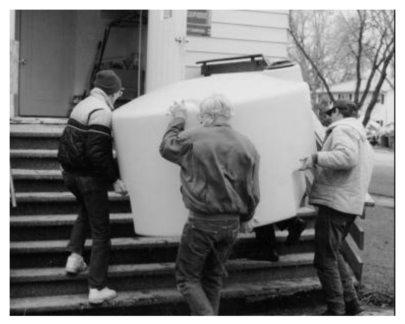
Nazarene Disaster Response volunteers assist with clean up, restoration, and rebuilding in a Virginia flood.

NDR is a national network of volunteers who respond to victims of natural and manmade disasters. NDR is a part of Nazarene Compassionate Ministries, which started in 1991 as a charitable organization, chartered and sponsored by the Church of the Nazarene. The need for an organized disaster response team representing the Church of the Nazarene became apparent during major disasters in recent years. In January 1994, a group of leaders met in