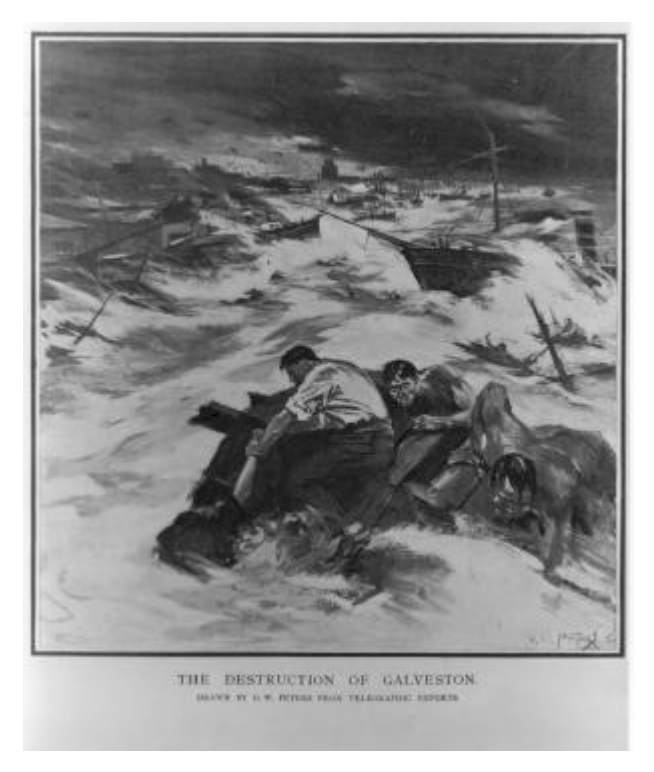
This drawing depicts the devastating tidal waves that resulted from Galveston Hurricane. (Used with the permission of the American Red Cross.)

The American Red Cross, the Salvation Army, and other voluntary agencies set up a warehouse for the distribution of clothing, including one million donated clothing items. These agencies also established shelters for the homeless and provided relief to farmers by purchasing new plants and seeds. The Salvation Army sent officers from across America to go to the disaster site and provide spiritual counsel and assistance. Following the Galveston Hurricane, the Salvation Army developed local, regional, and national disaster service programs. The Galveston Hurricane was the last time that Clara Barton of the American Red Cross, then 78 years old, actively participated in a disaster relief project.