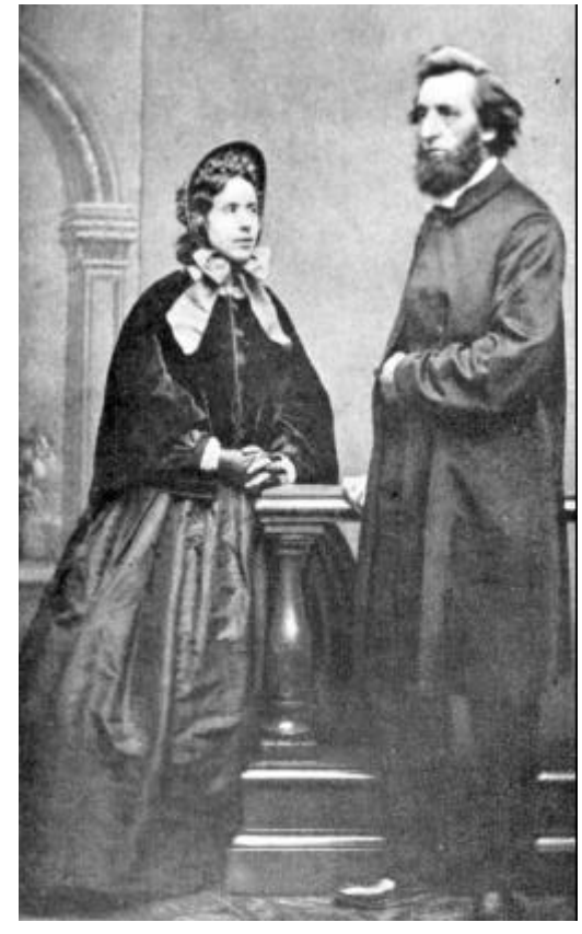
Catherine and William Booth, founders of the Salvation Army.

The Salvation Army has been providing disaster relief assistance since 1900. On September 8, 1900, when Galveston Hurricane occurred, the Salvation Army sent