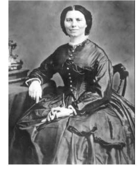
Clara Barton, Founder of the American Red Cross. (Used with the permission of the American Red Crossage 2-19

"to continue and carry on a system of national and international relief in time of peace and apply the same in mitigating the sufferings caused by pestilence, famine, fire, floods, and other great national calamities, and to devise