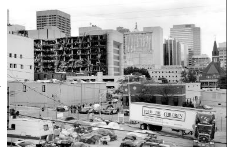
The Murrah Federal Building in Oklahoma City after a massive bomb inside a rental truck exploded in front of the building.

at day care at the Murrah Federal Office Building in Oklahoma City, the unthinkable happened. A massive bomb inside a rental truck exploded, blowing half of the nine-story building into oblivion. A stunned nation watched for nearly two weeks as the bodies of men, women, and children were pulled from the rubble. When the smoke cleared and the exhausted rescue workers packed up and left, 168 people were dead in the worst terrorist