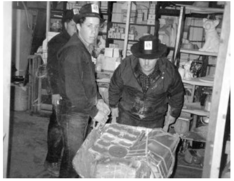
Volunteers from Mennonite Disaster Services provide clean-up services after flooding in Pennsylvania.

committee mobilized at least once a year to help in major disasters in Kansas. Oklahoma, and Nebraska. In 1993, MDS was incorporated as a non-profit organization separate from the Mennonite Central Committee. Today, MDS is organized into four regions in the U.S. and one in Canada. Within the five regions, there are 40 local MDS units. These units have the primary responsibility to represent MDS in a disaster response within their own