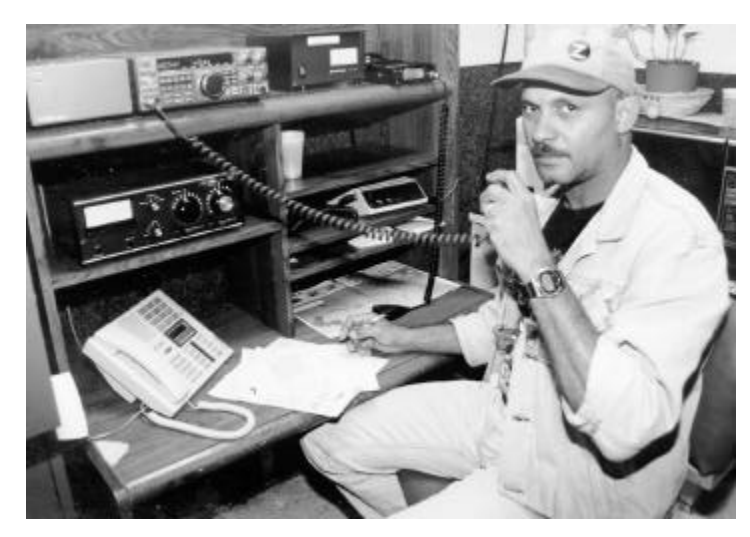
Amateur radio in action following Hurricane Marilyn.

Public service communication has been the responsibility of the Amateur Radio Service since 1913, when several radio amateurs in the Michigan/Ohio area successfully bridged the communications gap surrounding a large isolated area left by a severe windstorm in the Midwest. In those early days, such disaster work was spontaneous and without organization of any kind. ARRL was founded in 1914. Since