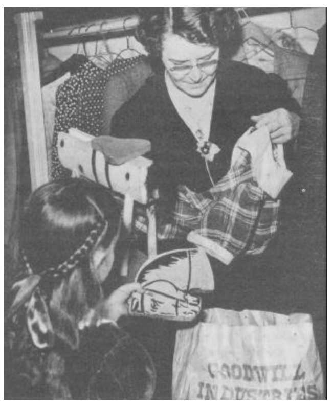
The Depression elicited many charitable responses, including collections of used clothing and goods from almost every family able to give.

Upon American entry into World War II, the American Red Cross recruited more than 71,000 registered nurses for military duty. The American people further supported the Red Cross through contributions of nearly $785 million. During World War II, Adventist Community Services established warehouses in New York and San Francisco to process materials to ship overseas to Europe,