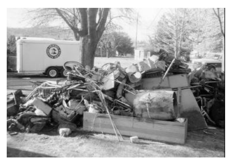
Friends Disaster Service help clean up flood debris after a 1996 winter flood in Williamsport, PA.

FDS was organized in 1974 in response to the increasing number of disasters in the U.S. FDS draws its volunteer work force from pre-registered and organized units from Friends Churches throughout the Midwest, Southern, and Eastern U.S. FDS has 15 trailers stationed across its working area. These trailers are stocked with tools and equipment pertinent to disaster response and rebuilding. FDS derives its financial support from an annual auction and donations from caring supporters.