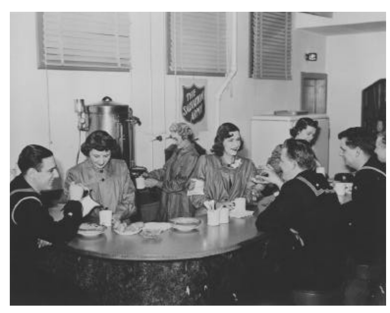
Women volunteers with the Salvation Army served doughnuts, pastries, and coffee to coastguardsmen during World War I.

When World War I was officially declared, American women again mobilized extensive support systems. The National Woman's Committee quickly formed state organizations, which in turn developed local committees of volunteers in every county and city. In this war, some women even went abroad with the troops for the first time. Women volunteers from the Salvation Army served as chaplains and "Doughnut Girls" during World War I. The war brought unprecedented cooperative action between voluntary organizations. The YMCA,