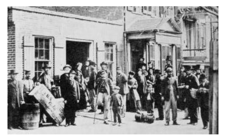
The U.S. Christian Commission headquarters in Washington, D.C., "served hot coffee, prayers, and general good cheer" to Union soldiers.

The need for arms and ammunition was met by private volunteer efforts during the war. Huge amounts of money were raised, often from donated jewelry, to buy and construct gunboats and other necessary fortifications. In addition, charitable organizations in the North and South provided food, drinks, and spiritual comfort to the soldiers of the Civil War.