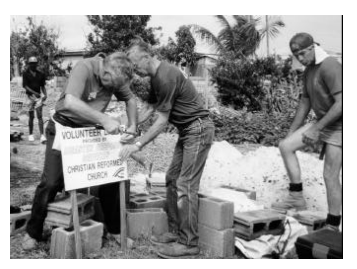
Volunteers from Christian Reformed World Relief Committee provide clean-up and rebuilding assistance in St. Croix following Hurricane Marilyn.

During Hurricane Marilyn, there was a unique level of government/ voluntary agency coordination. For example, two weeks into the disaster, Adventist Community Services took over the coordination of warehousing and the distribution of some Federal relief supplies. Mennonite Disaster Services, Church of the Brethren, and Christian Reformed World Relief Committee began tent platform building and installation on disaster victims' properties to reduce the shelter populations. FEMA supported this effort by providing ground transportation, building supplies, and equipment. For example, FEMA provided air transportation for the leaders of