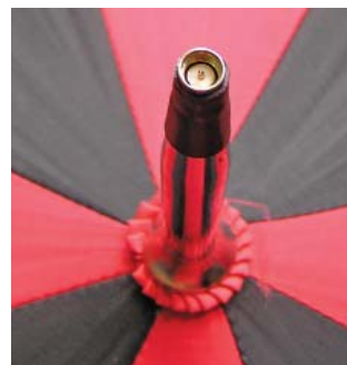
◀ Figure 1 — The SMA connector in the tip of the umbrella.