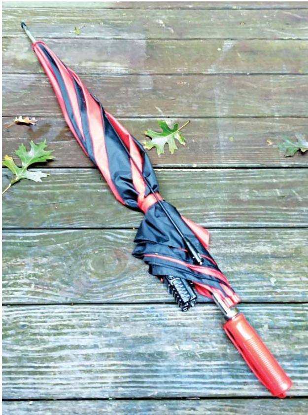
Figure 4 — The ComBrella can be folded easily for storage or transport.

wire to the braid on the side facing down toward the handle. Use heat-insulating material, such as kitchen-variety sheet silicone, to prevent burning the fabric. With the wire loosely wrapped around each rib, push the wire ends into the holes at the end of the ribs where the fabric is threaded, leaving a little slack. When the umbrella is folded, the ribs straighten and lengthen slightly.