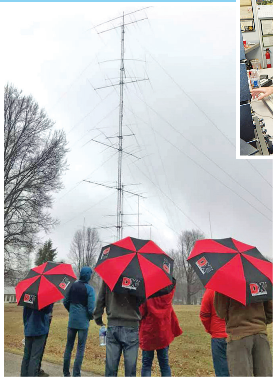
◀ The group was given an antenna tour at the K3LR superstation when they arrived in Pennsylvania.