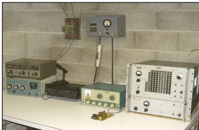
Mike’s FMT transmissions will be powered by Heathkit, but the stable source of the signals is Hewlett-Packard instruments, synchronized to GPS satellite time.

During the time at which FMT transmissions are made from W1AW, propagation does not favor the West Coast. This was reflected in the locations from which measurement reports were submitted, mostly east of the Mississippi. While the ARRL